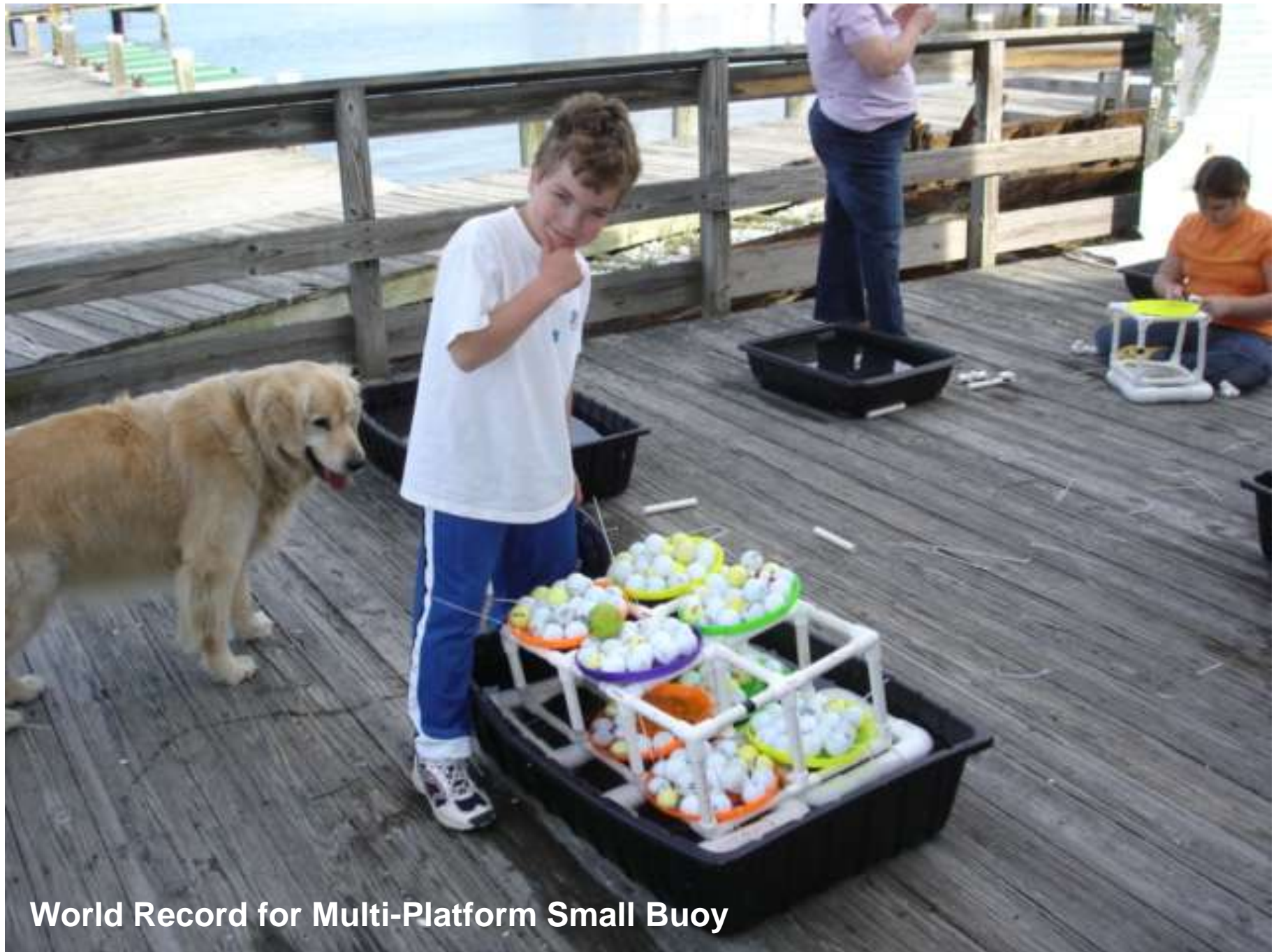
World Record for Multi-Platform Small Buoy