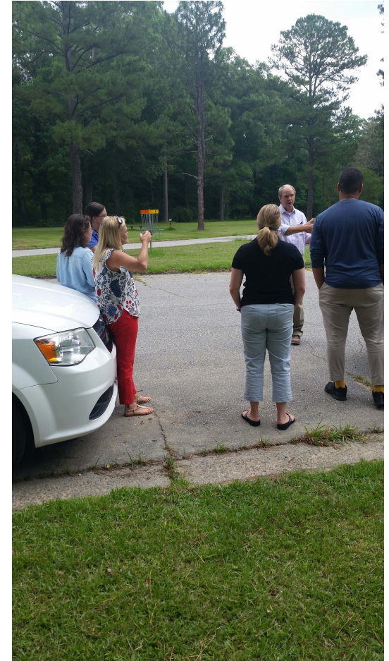
Partners discuss post-disaster buyouts on site