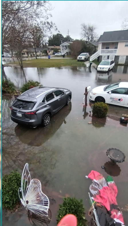
Whaley Way (nearby across the intersection)