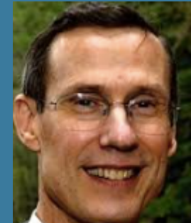
SECOORA Board Representatives