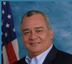
Rep Sablan – Lead co-sponsor

Clawson (R-FL-19) Crenshaw (R-FI-04) Posey (R-FI-08) Jolly (R- FI-13), Buchanan (R-FL-16) Wasserman-Schultz (D-FL) Wilson (D- FL), Murphy (D-FI-18), Brown (D-FL-05) Caster (D-FI-11) Hastings (D-FL-20) Deutch (D-FL-21), Rooney (R-FL-01), Mica (R-FL-07), Webster (R-FL-10) Curbelo (R-FL-26), Ros-Lehtinen (R-FL-27)