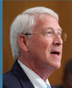
Sen Wicker- Lead