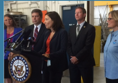
Sen Cantwell - Co-Lead